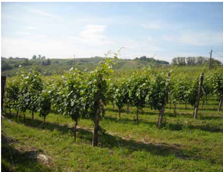
Experimental vineyard in Northern Italy.