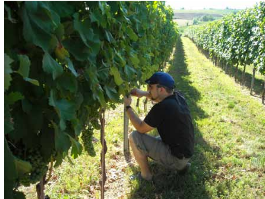
Bunch sampling in the Italian experimental vineyard.