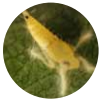
Scaphoideus titanus second instar nymph parasitized by the entomopathogenic fungus Lecanicillium lecanii .

Organic agriculture and, in particular, organic viticulture have grown considerably in the last decade, nonetheless organic farming still has a huge potential for innovation and improved solutions. The research project VineMan.org ( www.vineman-org.eu ) aims at improving disease control, which is one of the main and most difficult tasks in organic viticulture, by integrating plant resistance against fungal pathogens, vineyard management practices, and the use of biological control agents according to optimized outbreak forecasting systems.