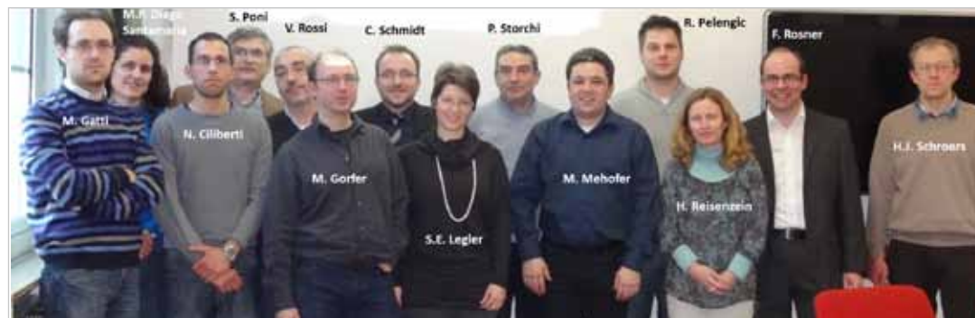
Project partners at the Kick-off meeting, held in Piacenza (Italy) in January 2012.

The authors thank all the participants to the project for their contribution to the article.